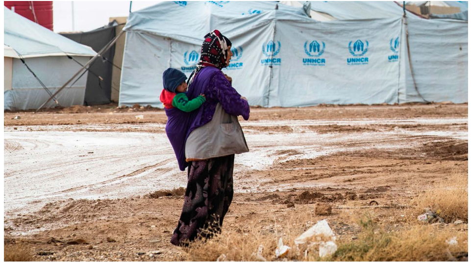
A woman carries an infant on her back at the Kurdish-run al-Hol camp for the displaced where families of ISIS foreign fighters are held in December 2019. Approximately 200 Syrian displaced people, mostly women and children, were headed home from an overcrowded camp, according to a Kurdish official.

U.S. Leadership: The U.S. military presence in Syria – which although not directly involved in the governance of the camps, has underpinned their existence – is no longer assured. The Trump administration can also not be relied upon as a check on Turkish efforts in northern Syria. Without the assurance of U.S. support, seeking shelter behind the Syrian regime and its Russian backers is an increasingly realistic option for the Kurdish leadership – especially in the face of Turkish advances in northern Syria. A tightening on the SDF's relations with Damascus would also be consequential if the Syrian regime – notorious for its abuse of prisoners – were given a greater