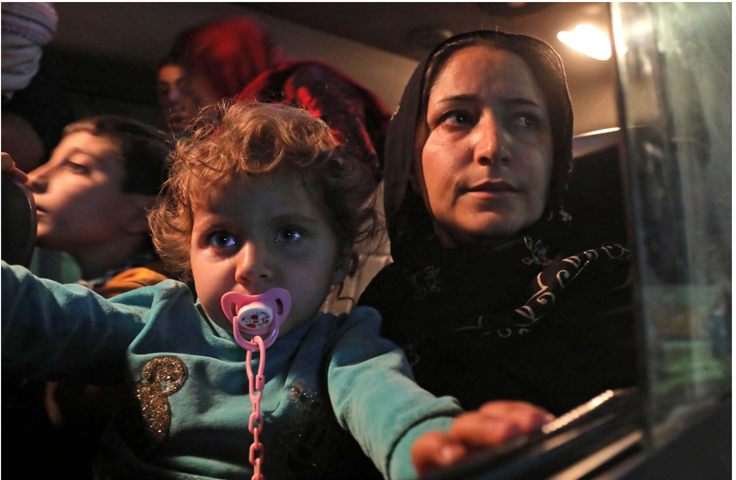
A Syrian woman and child arrive at the Bardarash camp in October 2019. Kurdish northern Iraq has received more than a million Iraqis fleeing the fighting with ISIS between 2014 and 2017.

an independent and cross-border task force to gather evidence for prosecution of the crimes committed by individuals affiliated with ISIS. Plea deals for the return of some men could be made contingent on collaboration with authorities. Local journalists and investigators could be employed to gather the evidence to build such cases; there are precedents for such arrangements.