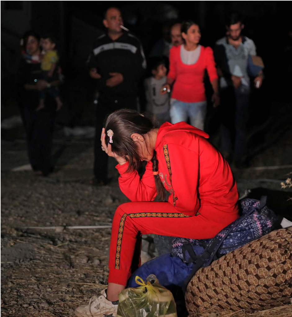
A young girl reacts as Syrian refugees arrive at the Bardarash camp, near Dahuk, in Kurdish Iraq on Oct. 20, 2019. Thousands of people, mostly women and children, fled fighting in northeastern Syria and crossed into Iraq.

ate with local authorities in Syria for the return of women accused of membership in the Islamic State and their children.”