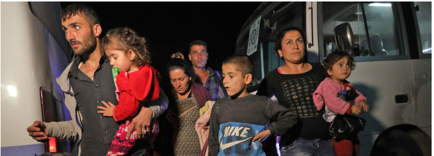
Syrian refugees arrive at the Bardarash camp near Dahuk, in northern Iraq in October 2019. They fled fighting in northeastern Syria into Kurdish-controlled Iraq.

COVID-19: On March 30, Syria reported its first death from the virus. According to the World Health Organization, only 64% of public hospitals are fully functioning, and there is a considerable shortage of trained staff, leading to concerns that the virus will spread rapidly through vulnerable populations, overwhelming the healthcare system. The situation in the last remaining opposition stronghold of Idlib – home to around 3 million people – remains unclear, but it is likely that the spread has already begun, given the cases in neighboring countries (Iraq, Iran) and Syria itself. The medical charity Médecins Sans Frontières (Doctors Without Borders) has warned that the spread of COVID-19 could quickly become critical if additional support and measures are not in place. Currently there is no internationally coordinated plan to deliver this support. The United Nations has appealed for cease-fires in all the major con-