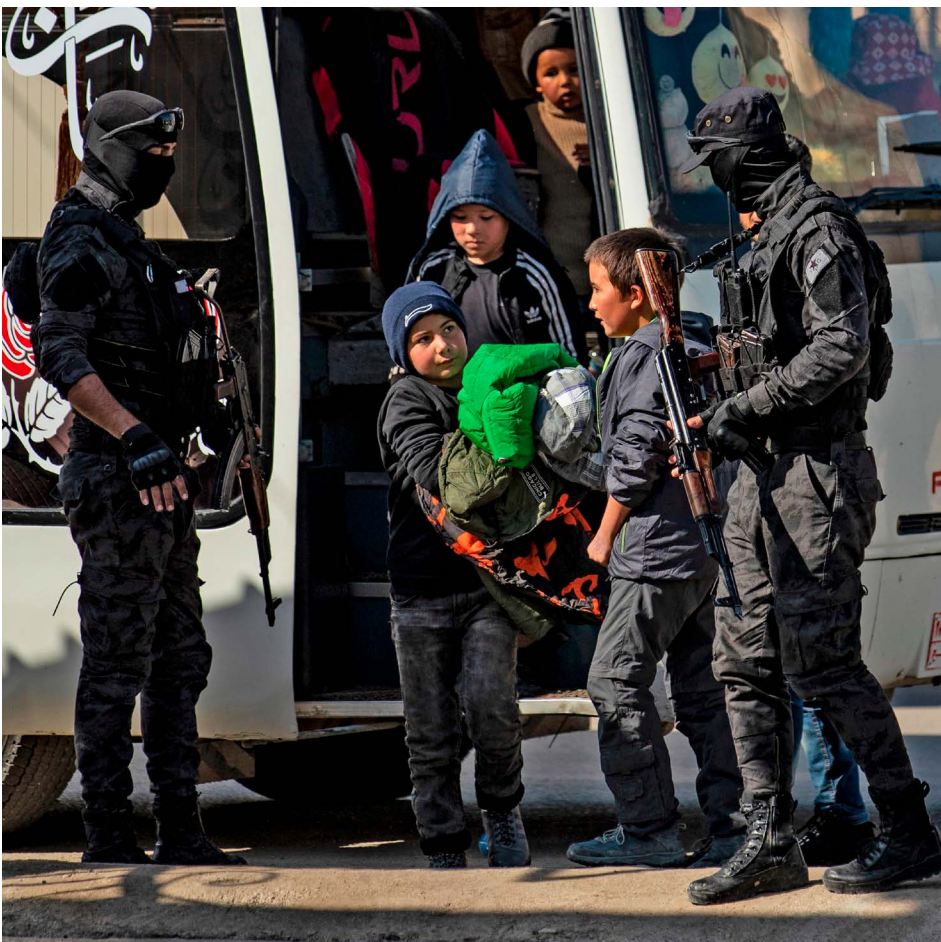
Russian orphans linked to ISIS arrive in Qamishli, Syria from the al-Hol camp in February. Syrian Kurds handed over more than 35 Russian orphans for repatriation.

viable future. Religious education must be provided by Muslim-led welfare groups to reinforce a positive religious identity (to counter propaganda) and a sense that detainees do not need to renounce their religion in order to move forward with their lives (as per ISIS propaganda). Finally, juvenile rehabilitation facilities already operating in northeastern Syria need resources and expertise from donor states and international nongovernmental organizations (NGOs). These facilities offer a way to immediately reduce the risks to European children while efforts toward longer-term solutions, like repatriation, continue. Several NGOs are already carrying out safeguarding and rehabilitation efforts in neighboring countries, including Iraq and Turkey. International support would vastly increase the facilities' capacities.