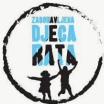
Forgotten Children of War Association (Bosnia)