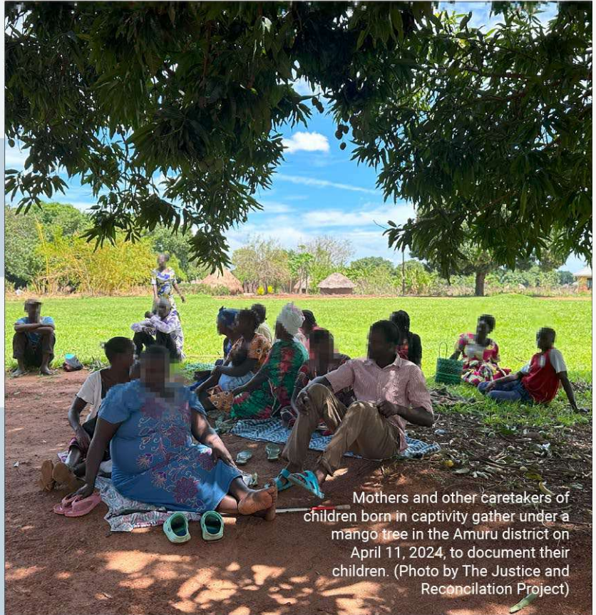
Mothers and other caretakers of children born in captivity gather under a mango tree in the Amuru district on April 11, 2024, to document their children.

These children are fathered by members of peacekeeping forces, who are stationed in areas of conflict and disaster, and local women. Depending on the view of the local population, these children may be perceived as enemies.