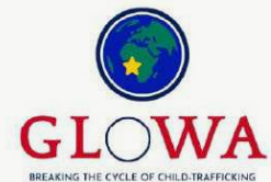
Global Welfare Association (Cameroon)