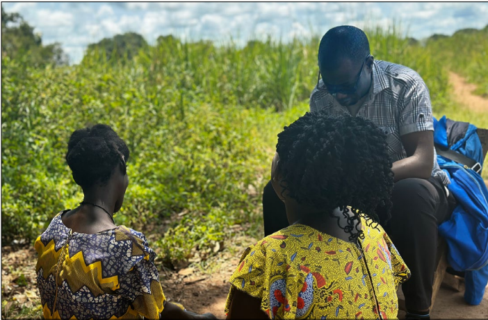
An enumerator talks with the mother of a child born in captivity with support from a survivor mobilizer on Aug. 14, 2024, in the Amuru district of northern Uganda.

Transitional Justice Policy, the lack of data on CBOW and other war victims is one of the foremost barriers to implementing a national reparations policy. CBOW in northern Uganda continue to lack identification documents, which hinders their ability to access services and excludes them from governmental development programs.