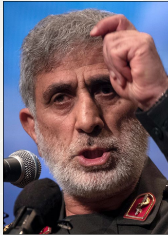
Commander of IRGC's Quds Force Brig. Gen. Esmail Qaani

These tensions came to a head with the January 2020 assassination of the head of the IRGC's Quds Force, Maj. Gen. Qassem Soleimani, in a U.S. drone strike in Iraq. The decapitation of the Corps' overseas operations had two consequences for the Iranian clerical and security establishments. First, it exacerbated the internal strife between factions that did not wish to see a confrontation with