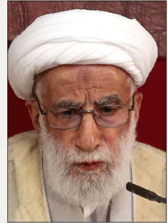
Secretary of the Guardian Council and Chairman of the Assembly of Experts Ayatollah Ahmad Janati

elements, the process did not lead to the strengthening of the conservatives.