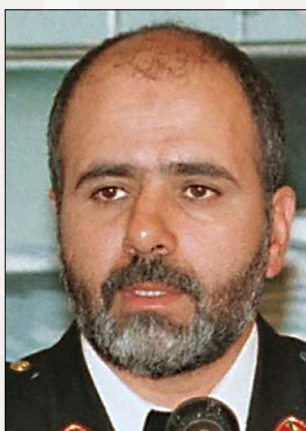
Secretary of the Supreme National Security Council Rear Adm. Ali Akbar Ahmadian (IRGC)

The move did not produce the desired results because the regime already had a complex structure, was deeply factionalized, and was being pulled in different directions by several power centers. There was also already no shortage of institutions designed to de-conflict, such as the Expediency Council and Supreme National Security Council (SNSC), both of which came into being as part of revisions to the Islamic Republic's constitution in 1988 and 1989. With these councils already failing to work, the addition of yet another state body intended to seek the increasingly elusive balance between various ideological factions only worsened the gridlock in the system.