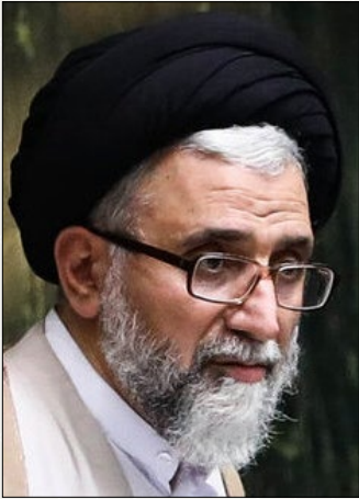
Minister of Intelligence Seyed Esmail Khatib