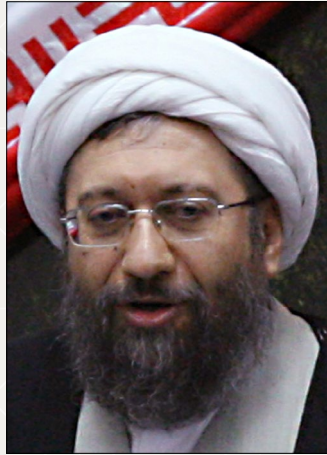
Chairman of the Expediency Council Sadegh Larijani