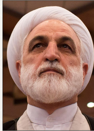
Judiciary Chief Gholam- Hossein Mohseni-Ejei