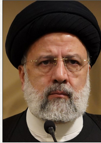
President Ibrahim Raisi

the IRGC. 67 Underscoring all this is the military establishment's recognition that despite power shifting to it from the clergy, it cannot govern without broader public support. Lifting social restrictions could help defuse some public anger against the regime. However, such a move could exacerbate intra-elite differences and embolden the public for more broader political freedoms, especially at a time of severe economic