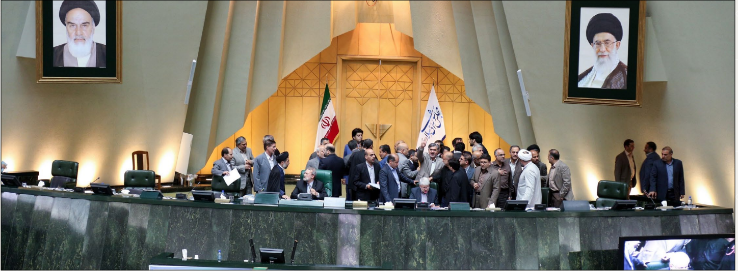
Iranian lawmakers approve the nuclear deal Oct. 13, 2015, in Tehran.

exacerbated the internal power struggle with fears among hard-liners that the growing contact between Tehran and Washington would subvert the republic. Khamenei himself warned of a U.S. “infiltration” via senior government officials whom he said were not willing collaborators but whose behavior aided American attempts to undermine the regime from within. 43 Likewise, then-IRGC chief Maj. Gen. Mohammad Ali Jafari said the nuclear deal had kicked off a long-term process to contaminate the thought and behavior of the Iranian leadership.