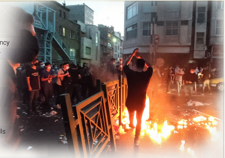
Protesters demonstrate against Iran's hijab laws in Tehran on Sept. 21, 2022.

2018: U.S. withdraws from nuclear agreement